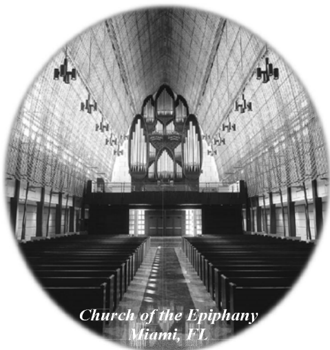
Church of the Epiphany Miami, FL

It is a rare company that can encompass the best of it all, yet this is our goal